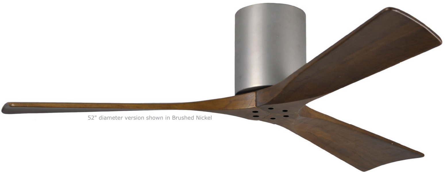
52" diameter version shown in Brushed Nickel

Cutting a figure like no other, the Irene-3H rodless-style fan, is rustic, yet strikingly modern with three neatly joined, solid walnut-stained wooden blades. A cylindrical motor housing complements its minimal profile. Irene-3H is streamline while still appearing warm and natural.