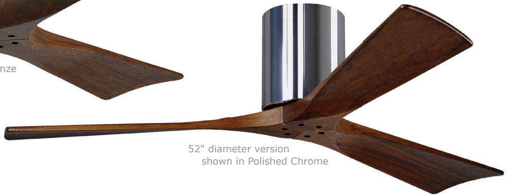
52" diameter version shown in Polished Chrome