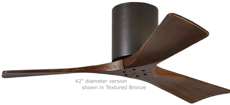
42" diameter version shown in Textured Bronze